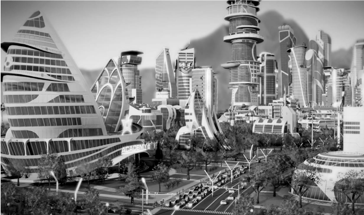
Figure 4. Screenshot of a city in SimCity (Electronic Arts Inc., 2019)

the real world. One of the studies we examined used SimCity in an urban geography course and investigated the game's potential for enhancing students geographic creativity (Kim & Shin, 2016).