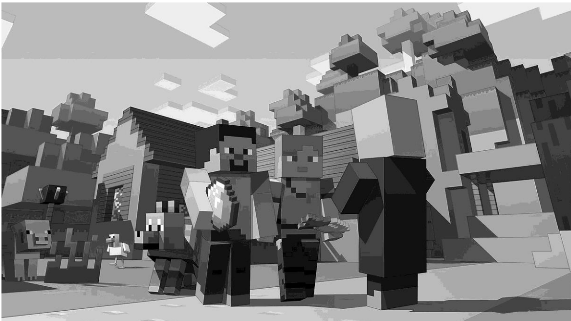
Figure 1. Minecraft game environment (from Peckham, 2016)

Sandbox games do not have a linear narrative that the player has to follow (Squire, 2007). Instead, the player can freely experiment in the game environment and build his or her own world. One example of a sandbox game is Minecraft (Figure 1), which is one of the most popular games of all time with 91 million people playing it every month (Peckham, 2016; Gilbert, 2018).