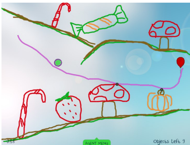
Figure 1. Ramp solution for a simple Physics Playground problem

Interface. Physics Playground is a two-dimensional game that requires the player to apply principles of Newtonian Physics in an attempt to guide a green ball to a red balloon in many challenging configurations (key goal). The player can nudge the ball to the left and right (if the surface is flat) but the primary way to move the ball is by drawing/creating simple machines (which are called "agents of force and motion" in the game) on the screen that "come to life" once the object is drawn (example in Figure 1). Thus, the problems in Physics Playground require the player to draw/create four different agents (which are simple machine-like objects): inclined plane/ramps, pendulums, levers, and springboards. All solutions are drawn with colored lines using the mouse. Everything in the game obeys the basic laws of physics relating to gravity and Newton's three laws of motion.