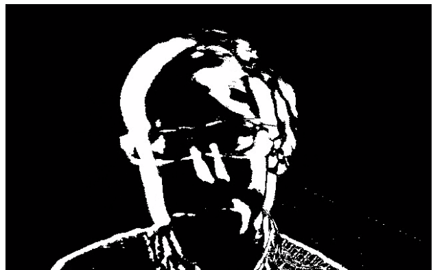
Figure 2. Silhouette visualization of motion detected in a video.

We also used features computed from gross body movement present in the videos as well. Body movement was calculated by measuring the proportion of pixels in each video frame that differed from a continuously updated estimate of the background image generated from the four previous frames (illustration in Figure 2). Previous work has shown that features derived using this technique correlate with relevant affective states including boredom, confusion, and frustration [11]. We created three body movement features using the maximum, median, and standard deviation of the proportion of different pixels within the window of time leading up to an observation, similar to the method used to create FACET features.