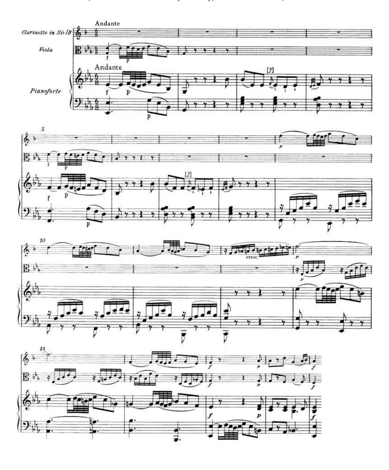
Mozart, Clarinet Trio in Eb (K. 498), first movement, measures 1-18

Preferred: 1 2 3 4 5 6 7 8 9 10 11 12 13 14 15 16 17 18