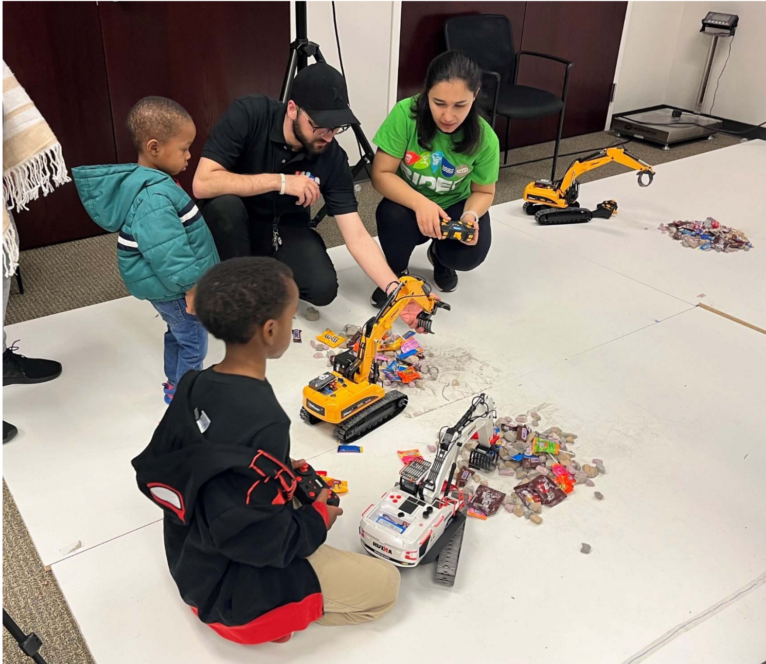
Remote controlled excavation was a big hit with next generation engineers