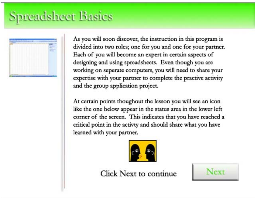
Fig. 1 CBI roles

Now let's put all of the design and coding skills you learned building your gradebook to use. Everyone is familiar with the monthly power bill, but have you ever wondered how