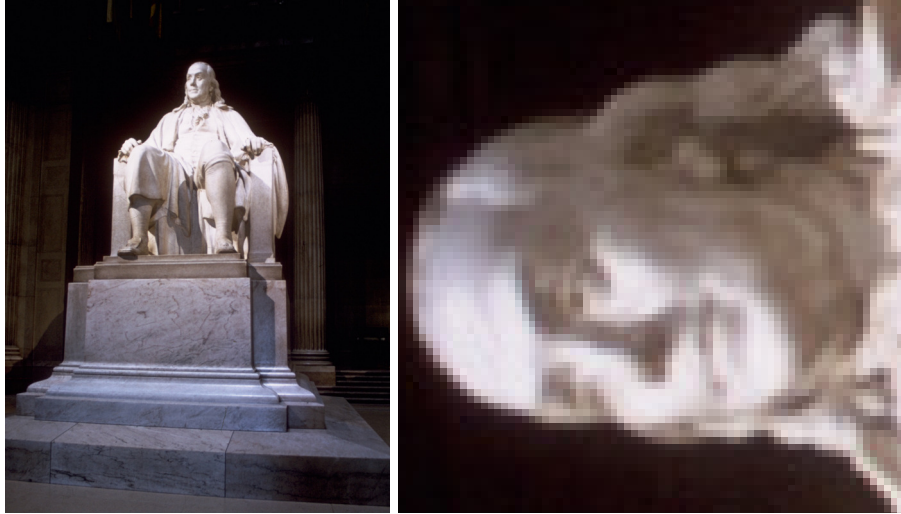
Figure 3.2: Benjamin Franklin, in raw form (left), and close-up and rotated (right). Note that the close-up figure displays “pixelation” effects (or, depending on your viewer, blurring effects) of a raster image scaled too large.

On the other hand, if the full-page image needs a caption, you’ll need to reduce the scale a bit more to fit it in. In addition, I could draw an outline around the figure with an \fbox command to give it a page-within-a-page appearance. In this case, I might want to leave a small amount of whitespace around the text of the inserted page. Making these modifications and leaving a bit of room for the caption gives us the commands below. You can see the results on page 16.