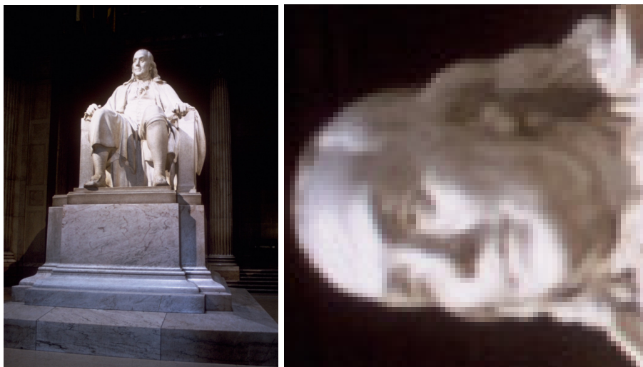
Figure 3.2: Benjamin Franklin, in raw form (left), and close-up and rotated (right). Note that the close-up figure displays “pixelation” effects (or, depending on your viewer, blurring effects) of a raster image scaled too large.

scaling required. As an example, the file rights in the figs folder is a full page of text with 1-inch borders on all sides. I can tell \includegraphics to trim this space and fill the rest of the page with a command like this: