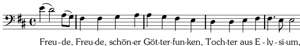
Example 3.1: The bass soloist's opening statement in the 9th Symphony.